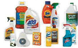
Laundry & Cleaning Supplies